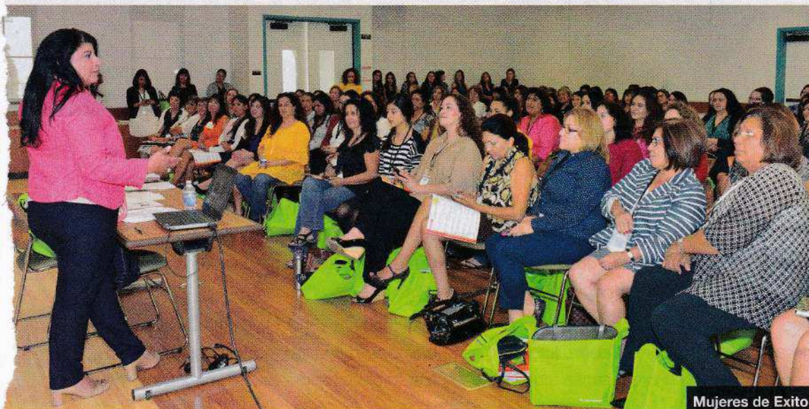
Mujeres de Exito

For more information about MANA San Diego and its programs, call (619) 297-0115 or visit www.manasd.org